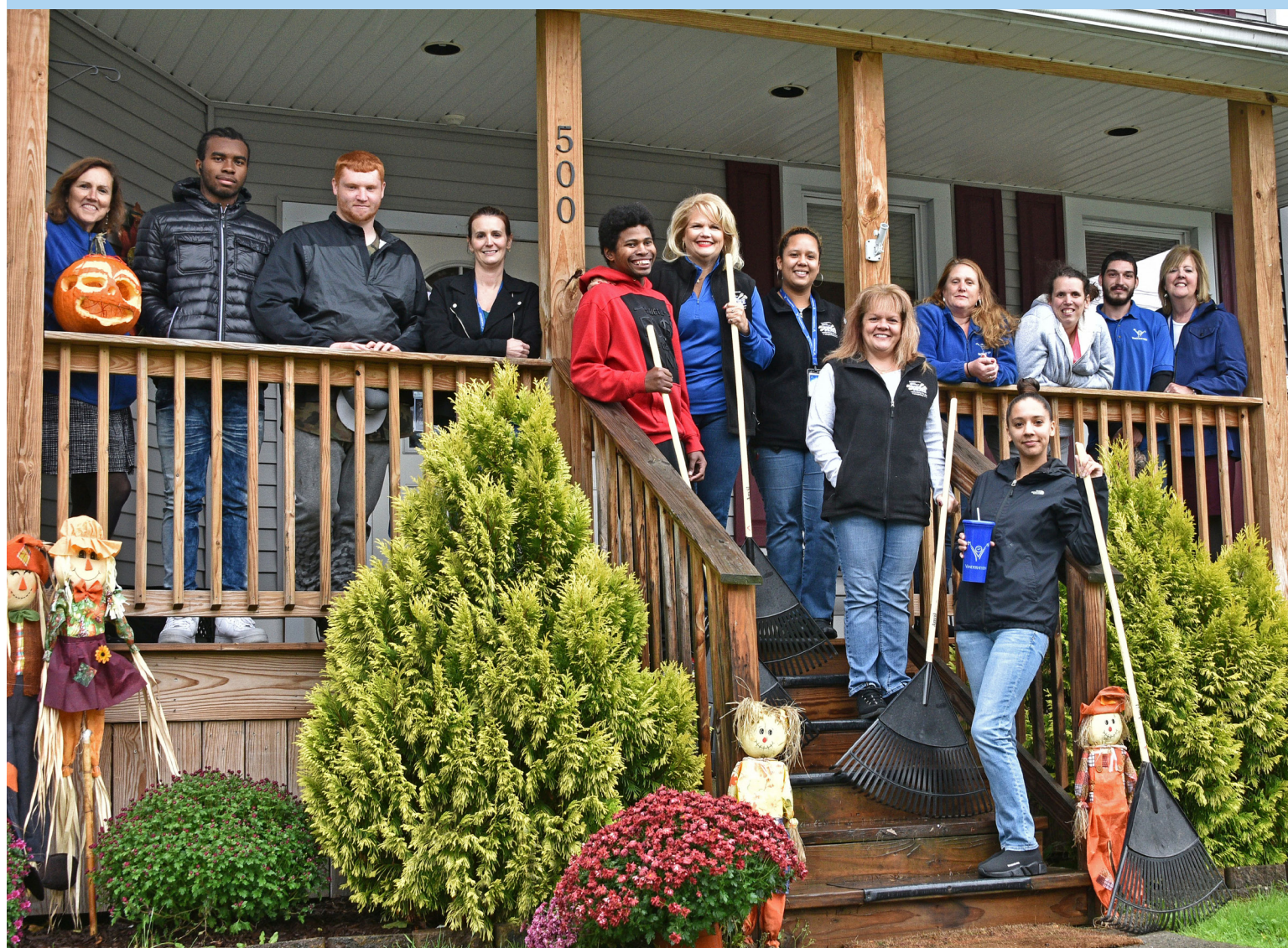
Our Pawling Avenue Group Home in Troy, New York

• Family Focused • Trauma Informed • Community Based