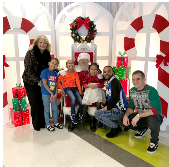
The Emerald Circle clients at CAP COM Financial Services provided a 2019 Holiday Party that our individuals attended along with a family from our Health Home program.