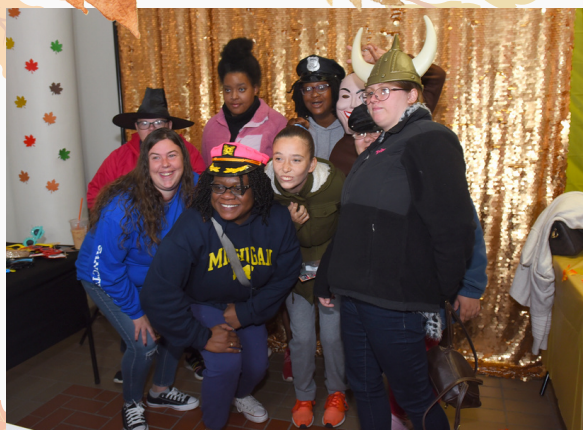
CELEBRATING 190 YEARS