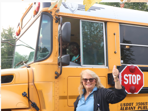
FIRST DAY OF SCHOOL