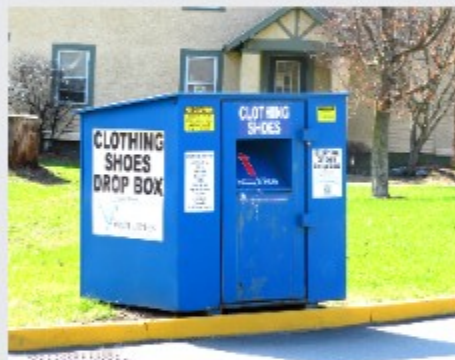
Donate to the Blue Box!

Vanderheyden is paid 5 cents per pound for the clothing collected. Any amount raised goes directly back to Vanderheyden and benefitting our individuals.