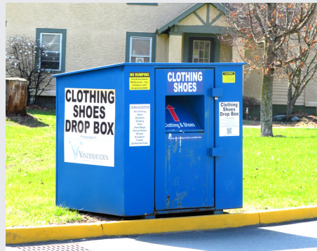
Donate to the Blue Box!

Vanderheyden is paid 5 cents per pound for the clothing collected. Any amount raised goes directly back to Vanderheyden and benefitting our individuals.